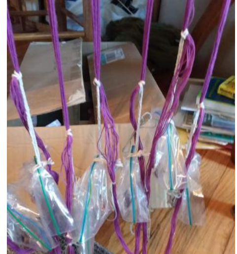
The supplemental warp hangs off the dowel but needs to be weighted. Here Carol used pennies in plastic bags, which she reports 'worked pretty well.'