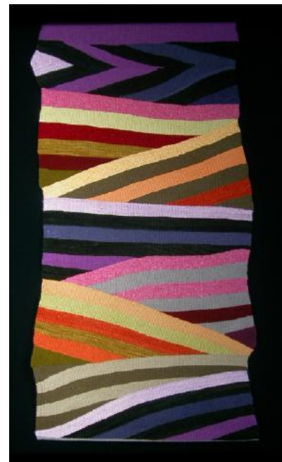
Deborah Corsini, Afterglow , 2006 Wool. 46" x 24.5"

In-person meetings are currently suspended, but JOIN US ON ZOOM