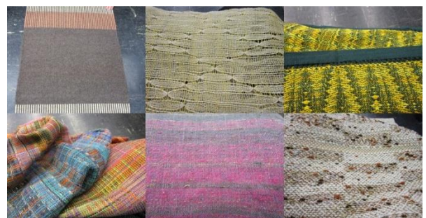
A nice sample of member work, showing the diversity of materials and techniques.