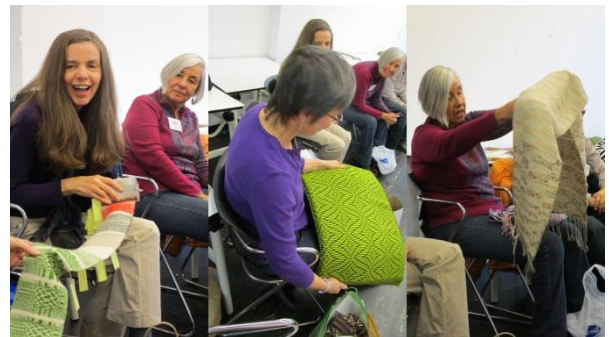
and showing and telling some more.